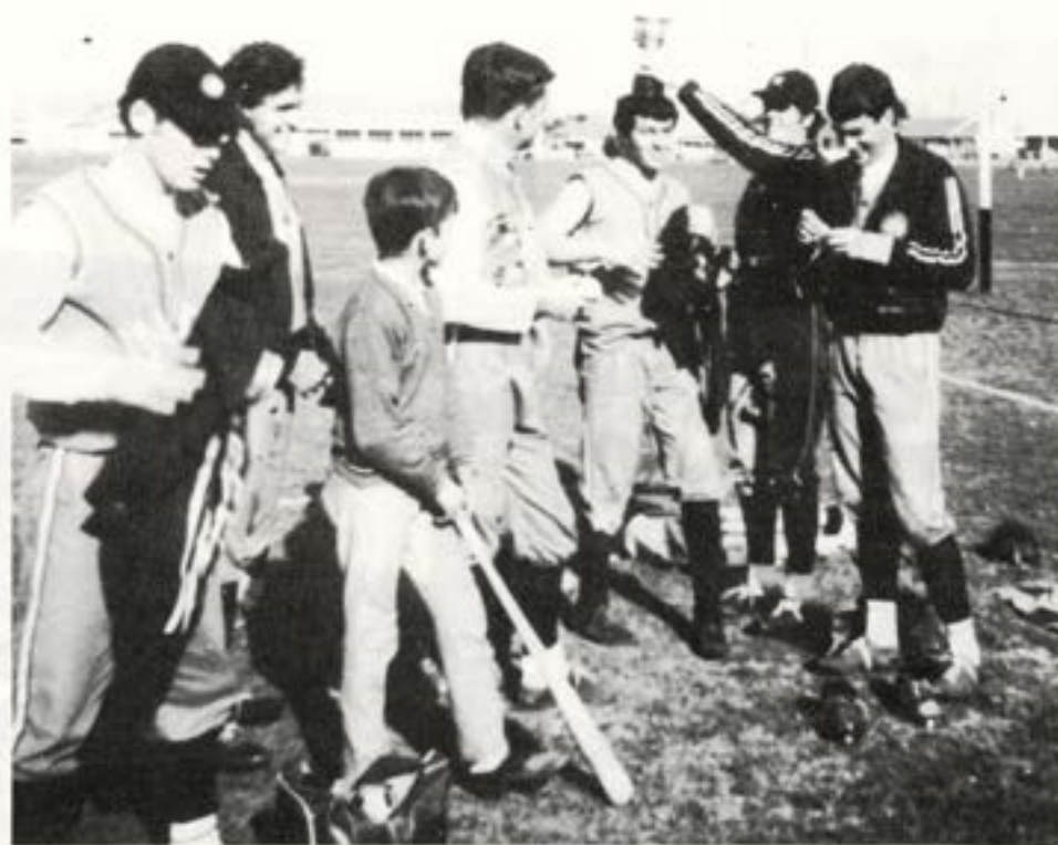
MINOR E PREMIERS, 1969

Once again, the premiership eluded Flinders and the Minor B team was runner-up for the flag. The Sports Association awarded four players club colours and Half-Blues.