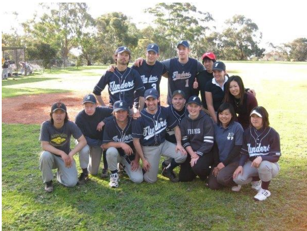
2008 Division 2 Flinders University BlueWave- SA Winter Baseball Association