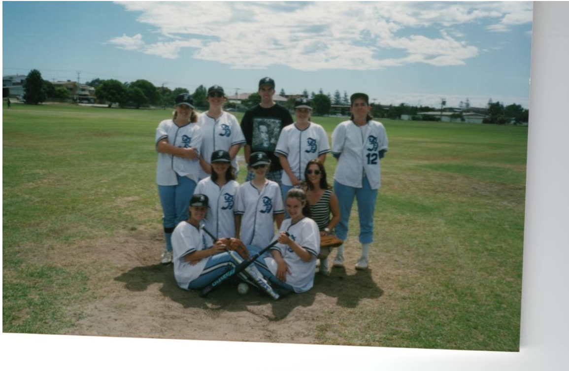
1993/1994 Womens C Grade Softball – SA Softball Association