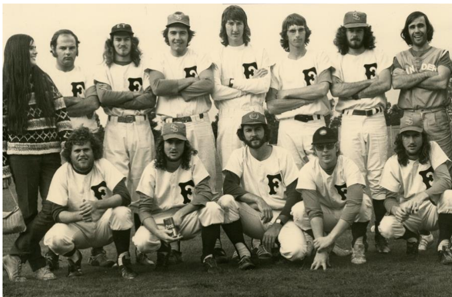
1973 Flinders University IntersVarsity Team