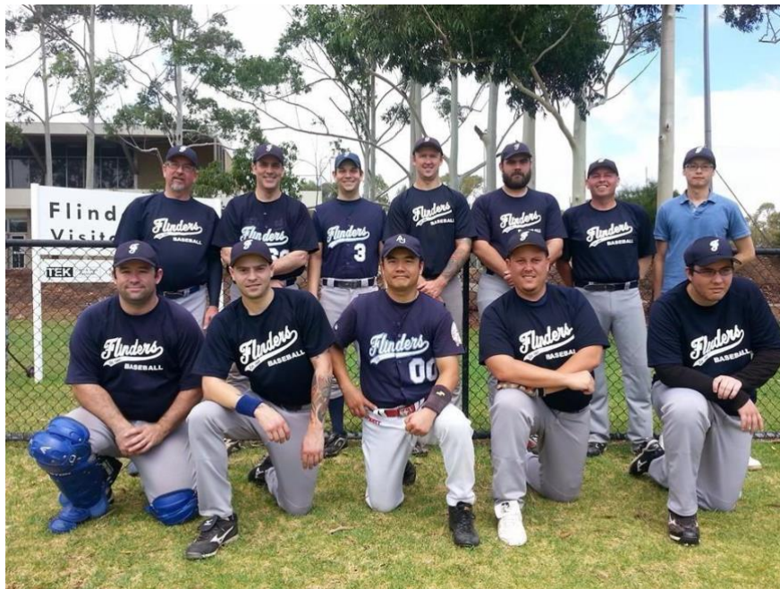
2014 Division 5- SA Summer Baseball Association