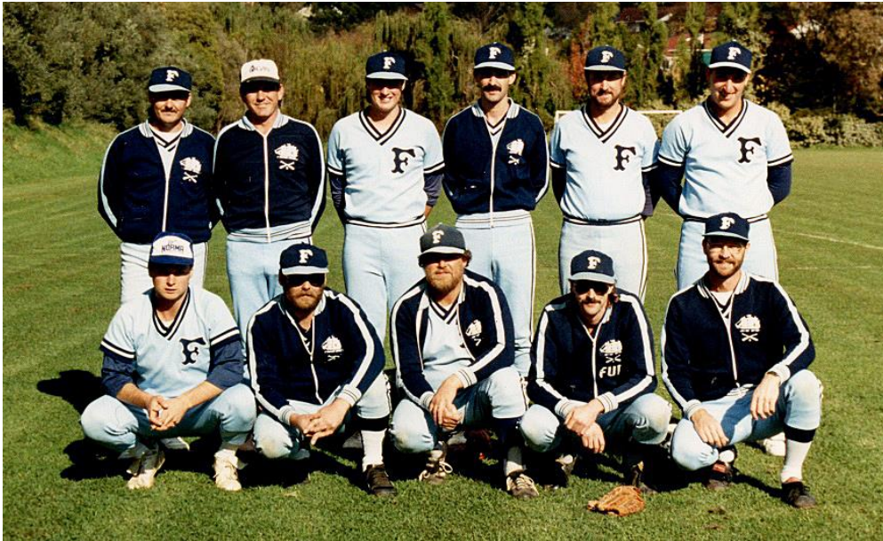
1989 Division 1 Premiers – SA Winter Baseball Association