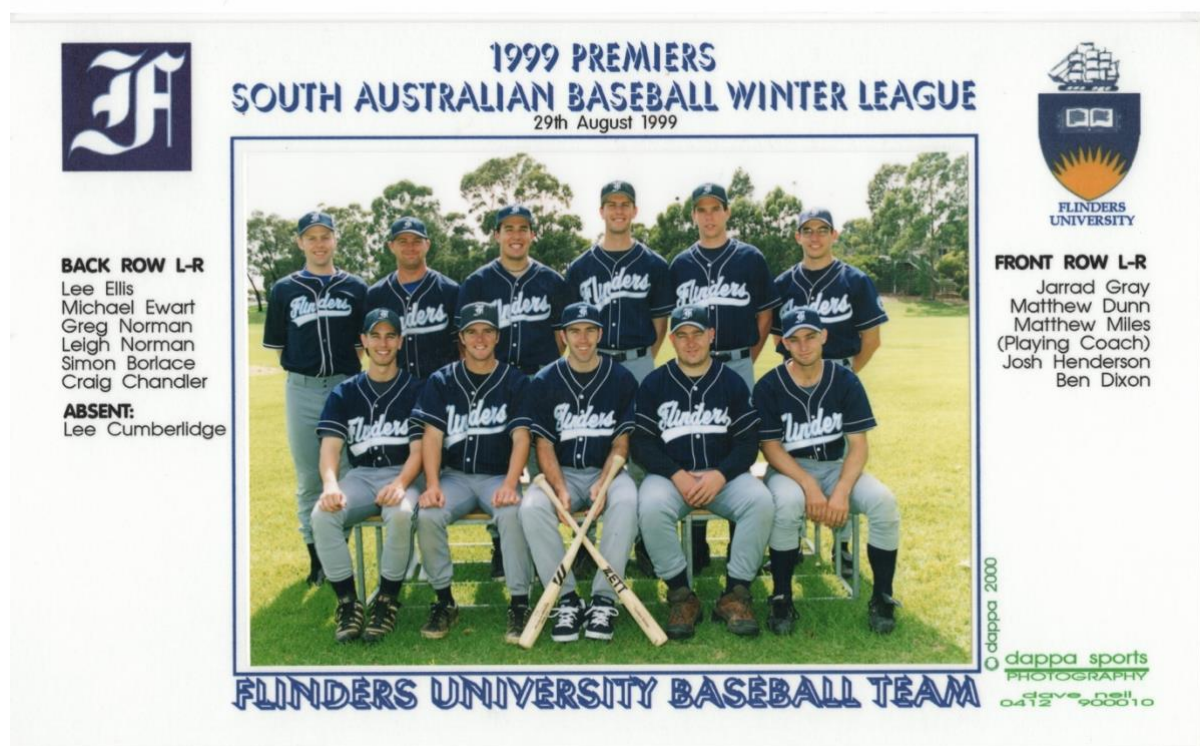
1999 Division 1 Premiers- SA Winter Baseball Association