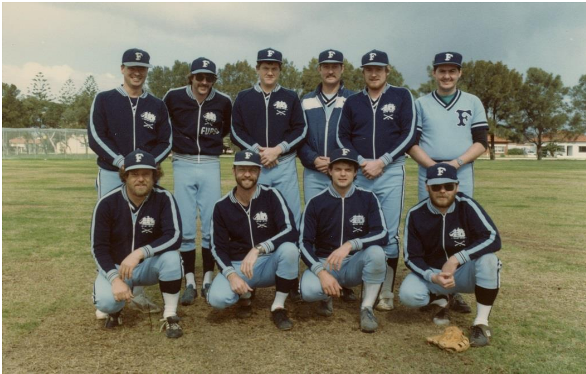
1985 Division 1 SA Winter Baseball Season

The beginning of the new Millennium saw some turnover in the Club with many of the players of the previous decade retiring or moving on and numbers declined. However currently Flinders University Baseball and Softball fields 4 teams in the SA Winter Baseball competition and is one of the largest “winter baseball” clubs and at least one team has been entered every year in the South Australian Baseball League since 1993. There have also been teams entered at the University Games reasonably regularly over the last ten years.