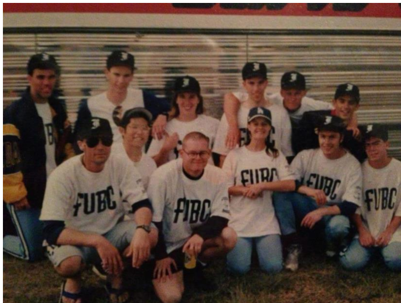
1993 Flinders University Baseball Team- Australian University Games