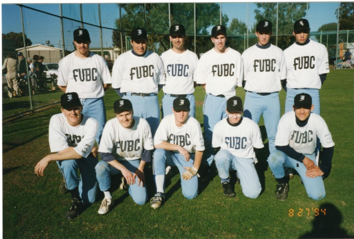
1994 Division 1- SA Winter Baseball Association

The beginnings of my baseball journey in Adelaide were Winter ball Saturday games on the bottom oval (before there was a car park there). No back net meant chasing foul balls down the back of the hill and the benches were literally that – portable wood benches that would struggle to fit 9 bums on them. The lack of facilities did not matter one bit. I would be up early every Saturday morning counting down the hours to game time, and we would play rain or shine.