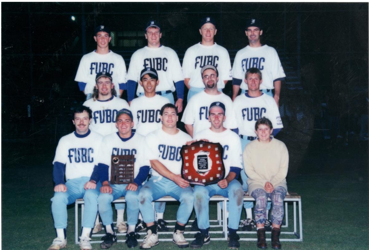
1995 Mens A Premiers – SA Softball Association

From this time the 1990s saw unprecedented growth for the Club which included a gradual increase in playing numbers from two winter baseball teams in 1991 to by the end of the decade the Flinders Uni baseball Club boasted; 6 winter baseball teams, teams entered each year at Intersarsity (now called Australian University Games of championships)- including Gold Medals wins in Baseball in 1995 and 1999. Re-Introduction of softball in 1993 with Mens and Womens teams entered (the Mens A team winning four premierships in a row, and the Mens B also winning a premiership) and re-introduction of Summer Baseball, firstly by entering teams through Adelaide Baseball Club but later in its own right, which has continued up until this day. By the end of the 1990s the Flinders University Baseball and Softball Club (the name change reflected the new advent of Softball into the club) with a membership of well over one hundred people was arguably the biggest and strongest University Baseball Club in the country.