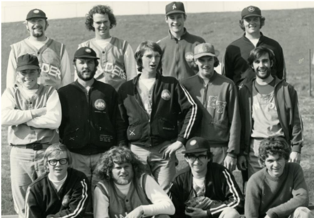
1971 Flinders University Intersarsity Baseball Team

In 1967 we travelled, by train, to Melbourne to play in our first Intersarsity, hosted by Monash. We stayed at the then infamous George Hotel in St Kilda, where we played havoc with the lifts. I don't recall much if anything about our baseball results, but I do recall that we were introduced to the "infamous" Monash Shandies at the boat races. There were some sick and sorry boys the next morning as some of us went to an AFL game before heading home on the Overland, while the Minor C team had to head back to Adelaide to play a semi-final.