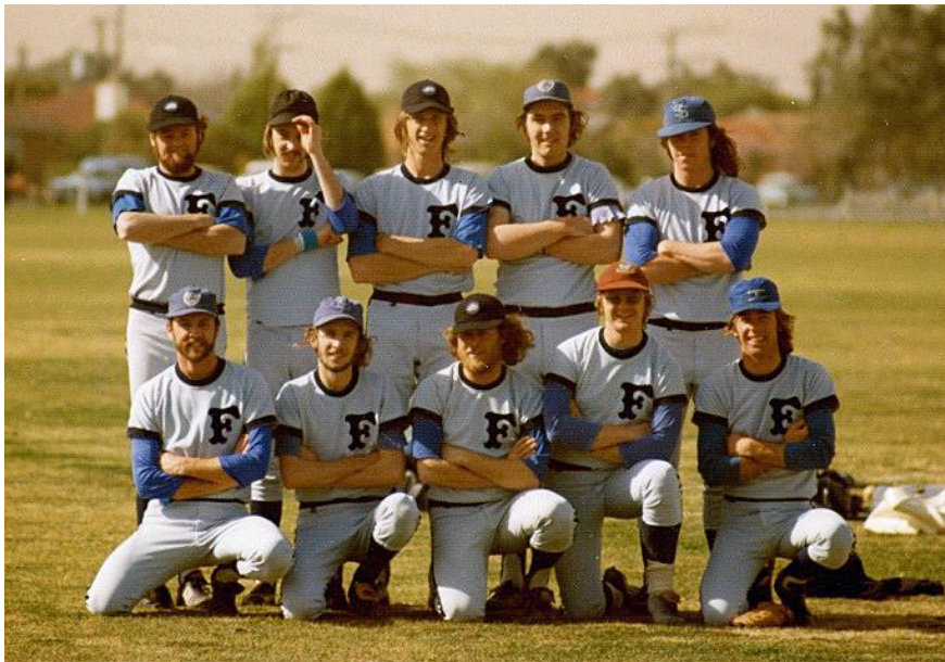
1976 Division 1 Premiers – SA Winter Baseball Association