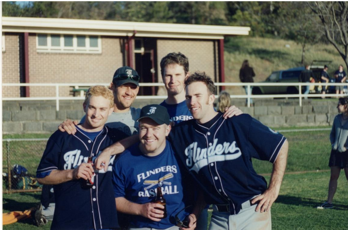
Post grand Final Celebrations after winning the Gold Medal at the 1999 Australian University Championships

Other baseball commitments eventually overtook my playing time at Flinders but I will always look back on my time here with fondness. It's great to see that the Club continues to go from strength to strength not only in the Winter association but with continuing numbers and success in the Summer league. Much is owed to the volunteers who put in many hours to ensure the club continues to grow. You know who you are. Congratulations Flinders on your first 50 years and all the best for the next 50. Thanks FUBSC.