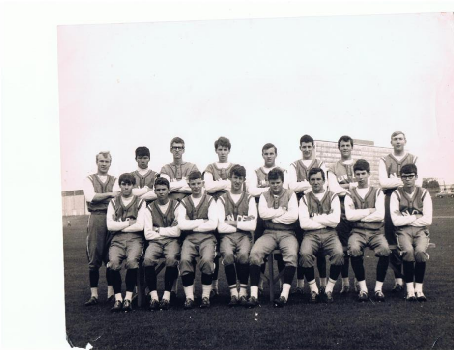
1967 Flinders University Baseball Interservice Team