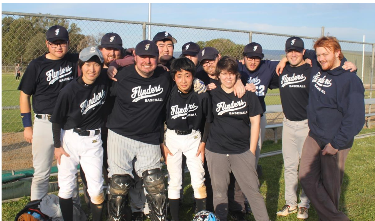
2015 Division 3 BlueEagles- SA Winter Baseball Association