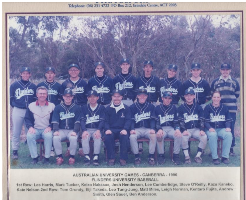
1996 Flinders University Baseball Team – Australian University Games