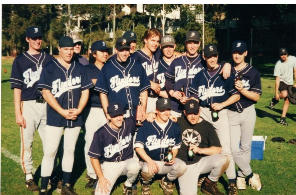
1998 Division 1 Premiers – SA Winter Baseball Association