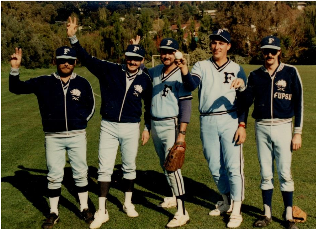
1989 Flinders University Pitching Staff