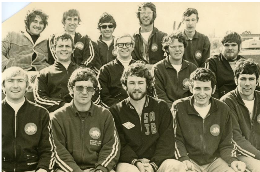
1970 Flinders University Baseball Intervarsity Team