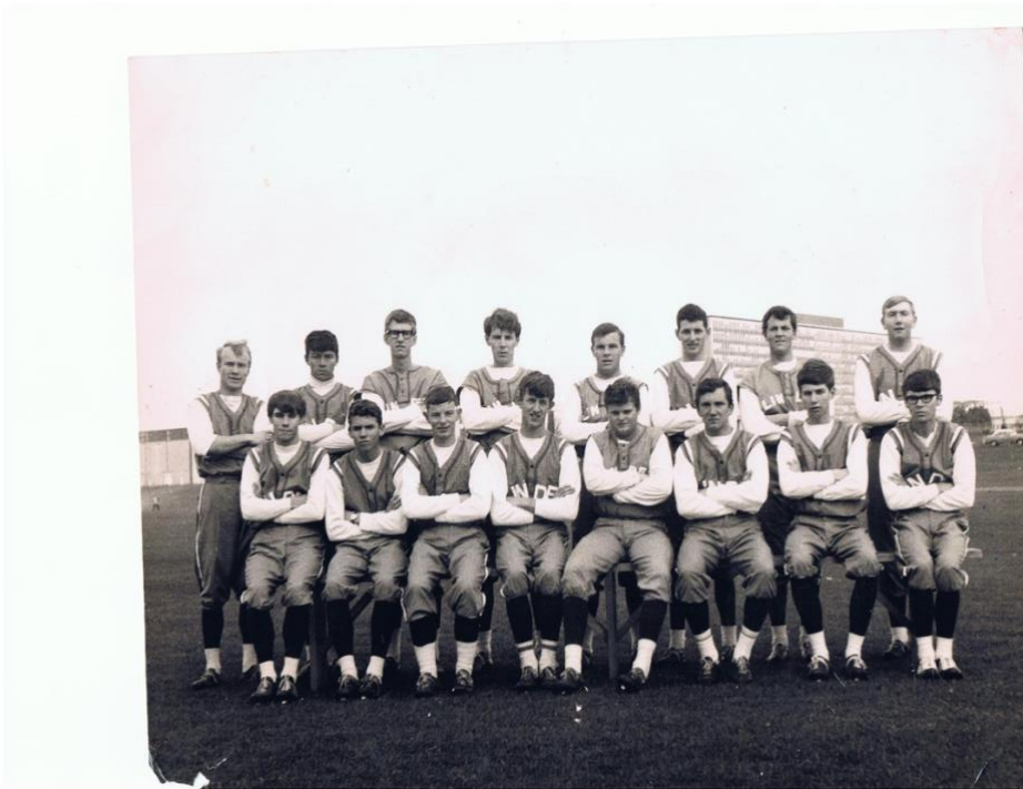
1967 Flinders University Baseball Interservice Team